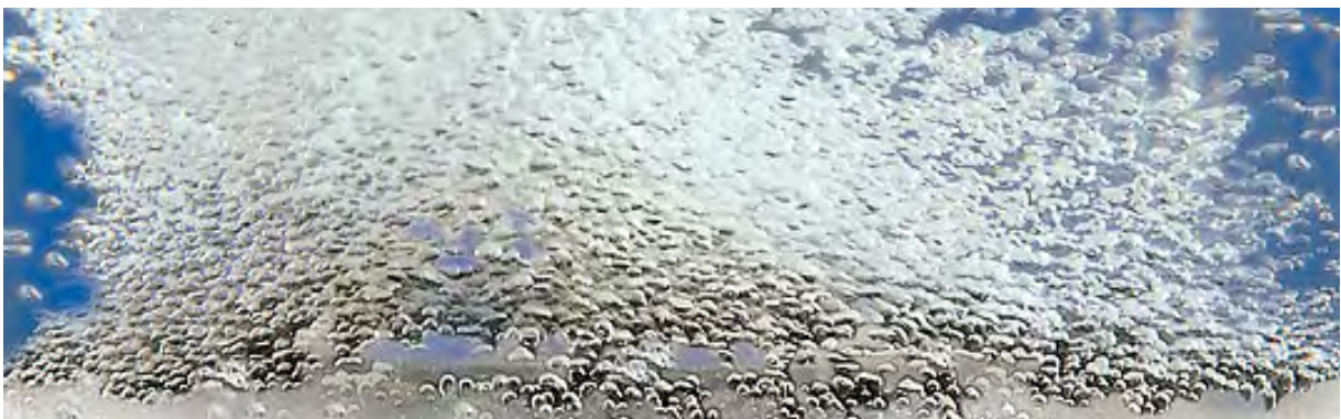
Reaction of the ozon in water

It is also the main reason why the traditional countries such as the United States of America, Japan which use chlorine as disinfection is